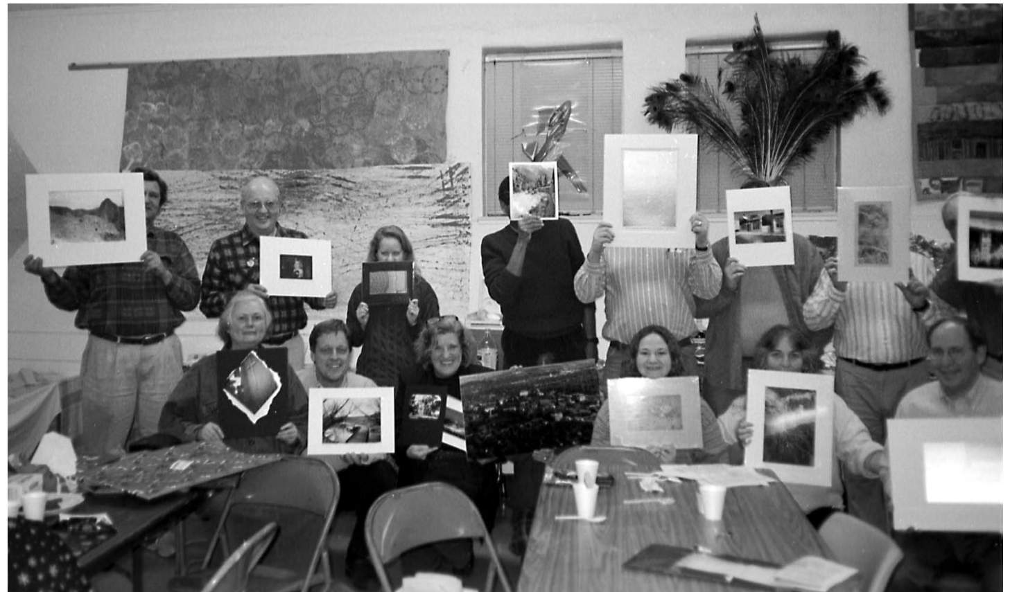
Print Exchange

Membership is open to all. Members include amateurs at all levels; professional photographers that specialize in brochure design and advertising, portraits and weddings, architectural photography, photojournalists and educators. Professional photographers often turn to fine arts photography for their personal LPA work. Many members have participated in juried and individual shows, and some have had work published in magazines and journals.