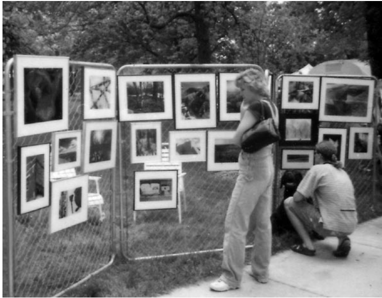
Art in the Park

The Lawrence Photo Alliance (LPA) was founded in 1984 to serve as a network for sharing interests, skills and tips, to organize exhibits, and to promote the art of photography. The original group had 20 members. Today's members are not only from Douglas County and the Kansas City area, but from all over Kansas.